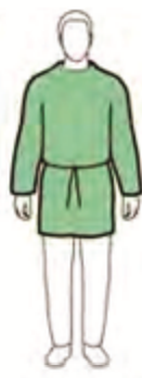
527 Smock Long sleeve, attached ties. Size: 71x91cm