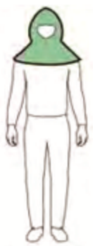
713 Hood Elastic face, Covers shoulders.