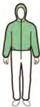
445, coat Coat with hood, zipper closure, elastic cuffs & waist.