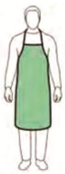
601 Apron Attached ties. Size: 71x91cm