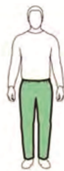
301, Pants Pants with elastic waist and ankles.