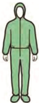
414, Coverall Coverall with hood and attached boot, elastic cuffs, waist & ankles.