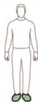
901 Shoe cover 904 Shoe cover (PVC sole)