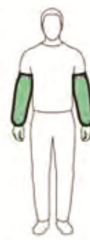
850 Sleeve Elastic ends Size: 18" length