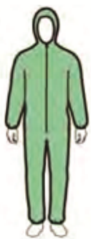
428, Coverall Coverall with hood, elastic cuffs, waist & ankles.